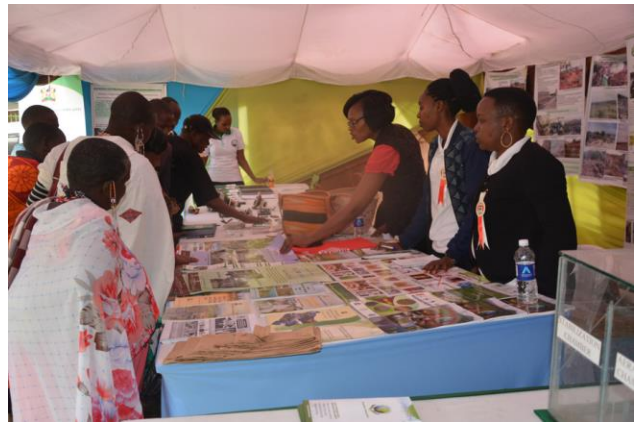
NEMA staff receives guests at NEMA booth during the Nairobi Trade Fair

exhibitors from far and wide who took positions at the Trade Fair to showcase their products, technologies and best practices across all sectors.