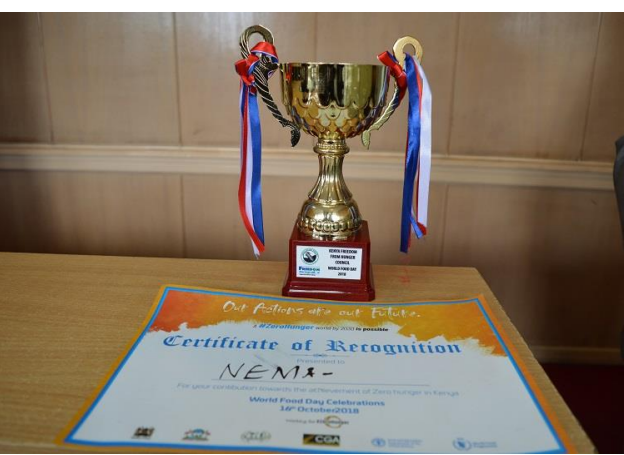
The trophy that NEMA won