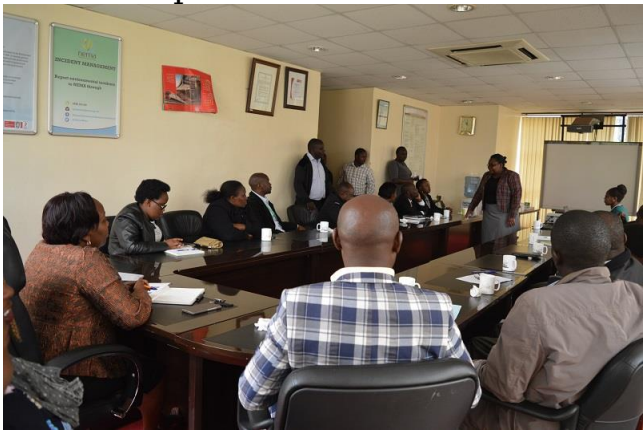
The training in progress at NEMA Boardroom

substance abuse as well as information on the service provision.