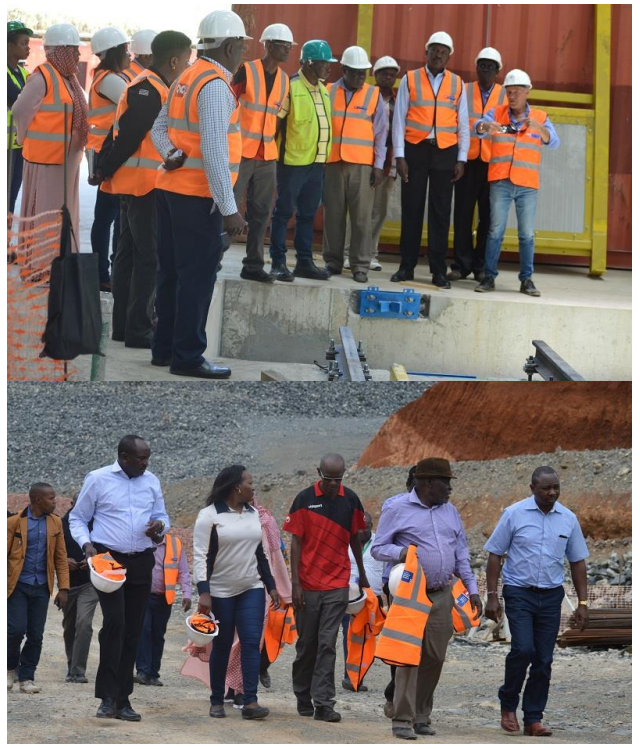
The tour of Itare Dam in Kuresoi, Nakuru County

prevention measures to protect the environment.