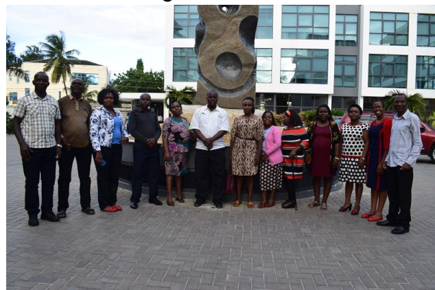
AF/GCF committee members during the induction at English Point Hotel, Mombasa

The workshop aimed at inducting the secretariat on the progress of the ongoing Adaptation Fund projects in the 13 Counties in Kenya and the status of Green Climate Funding.