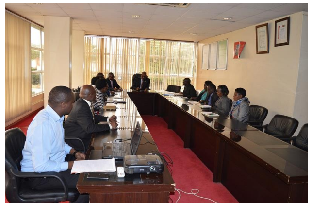
CAS at the NEMA boardroom holding a meeting with the management team