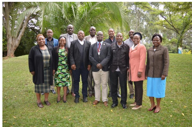
The regional managers and their trainers during the training at Utalii Hotel

The training focused on strategic planning, performance management, accountability framework, work planning, performance appraisal, ethics and integrity, field operations work plans, progress reports, monitoring among others.