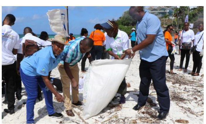
NEMA undertaking clean-up at Mombasa Beach during World Cleanup Day commemorations

Beach. The event included cleanups along the beach in line with the theme of "Revitalization: Collective Action for the Ocean" to raise awareness on the importance of keeping the beach free from litter.