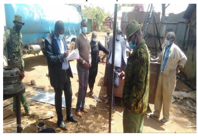
Joint Inspection going on at Apollo Garage in Marsabit Town

Some facilities were found to have violated provisions the EMCA (Waste Management) Regulations 2006). Garages were found to mishandle waste oil, Oil filters and car filters while hospitals were found mismanaging the biomedical wastes without any documentations as required by law.