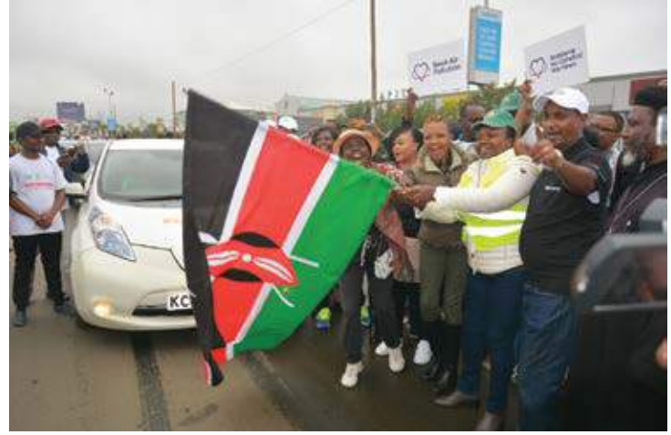
The launch of Nopia electric cars during the WED procession at Mombasa Road

The celebrations were spearheaded by NEMA and Nairobi County government. The leaders called on the government to adopt policies that reduce the emission of harmful greenhouse gases into the environment such as vehicle inspections, stop coal projects as well as inspection of industries to ensure they comply with air quality regulations. Promotion of clean energy will also go a long way in addressing air pollution.