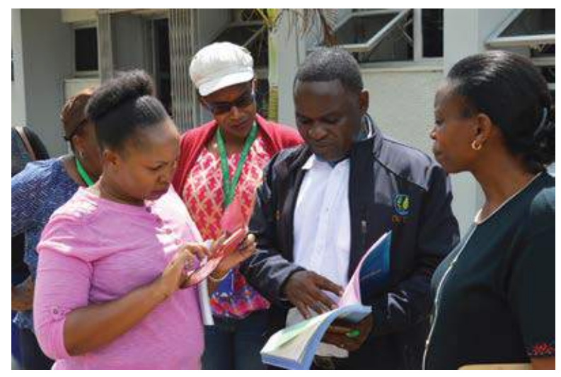
NEMA officers during an inspection in Industrial Area, Nairobi

As a result, the Authority has conducted stringent inspections leading to the arrest of several officials from industries without pre-treatment systems or those discharging into the environment.