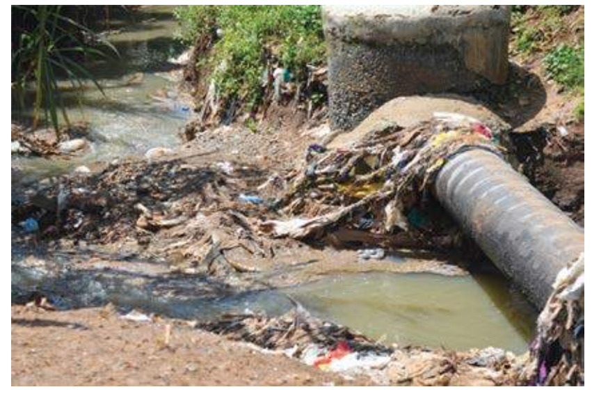
Raw sewerage flowing in Kirichwa River in Nairobi

NEMA led other agencies in the clean-up of Nairobi River in bid to conserve and reclaim its glory. The Authority partnered with a team from Nairobi County office, Water Resources Authority, Police Officers and Nairobi City Water and Sewerage Company in the month of February 2019.