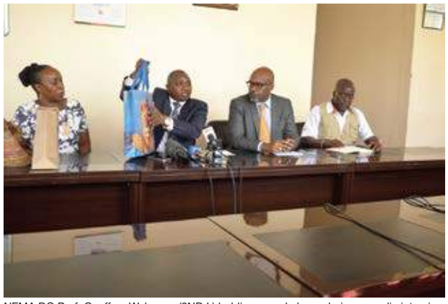
NEMA DG Prof. Geoffrey Wahungu (2ND L) holding sample bags during a media interview at NEMA headquarters

This single-usage of these bags will eventually lead to heavy environmental consequences due to poor disposal practices currently being experienced in the country coupled with the lack of requisite infrastructure to sustainably manage these bags.