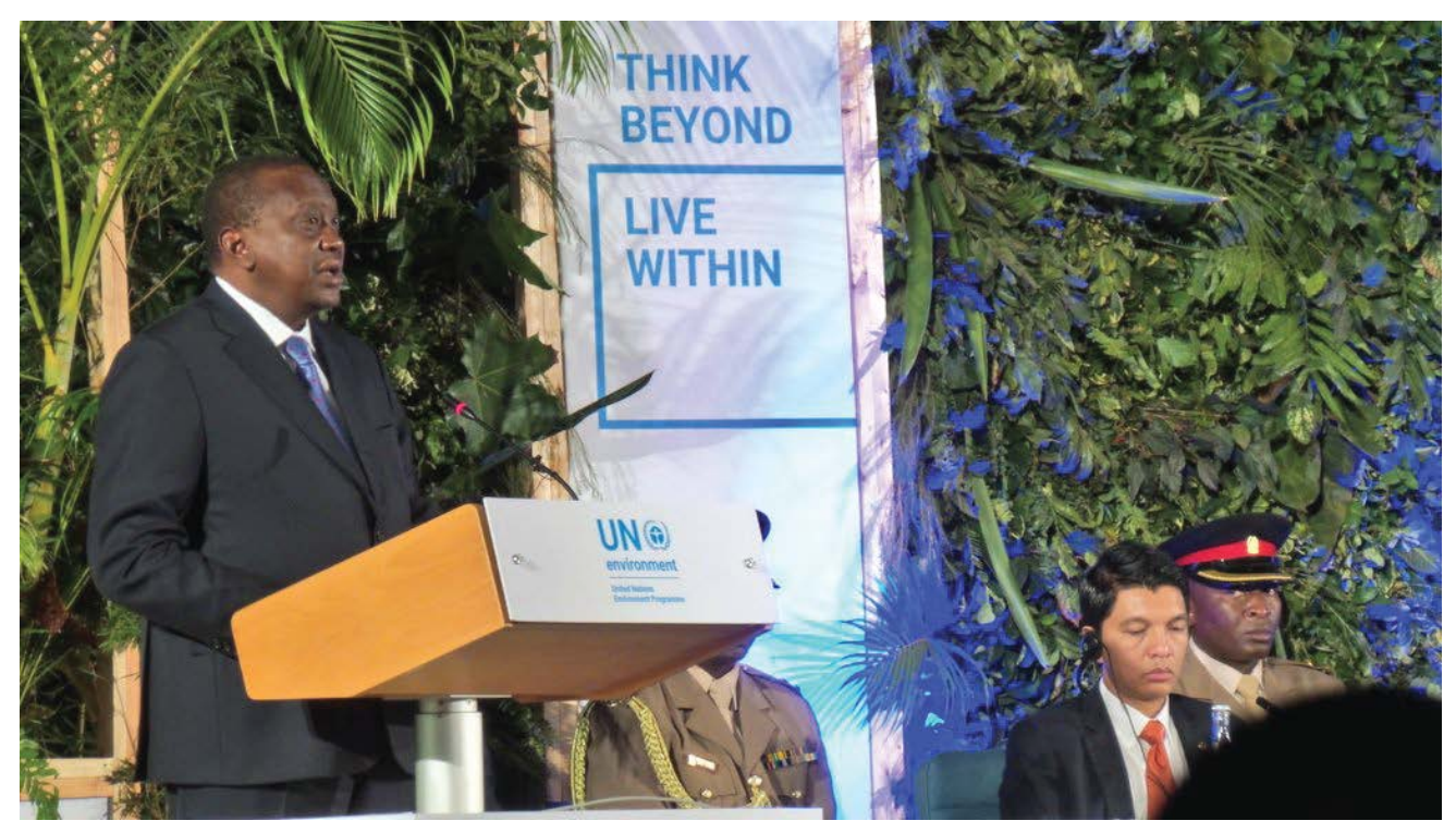
H.E President Uhuru Kenyatta addressing the participants at UNEA 4 at UN Gigiri Complex

The fourth session of the UN Environment Assembly gathered in Nairobi, Kenya from 11th to 15th March 2019. The assembly is one of the world's highest-level decision-making body on environment and brings together governments, entrepreneurs, among others to share ideas and commit to action.