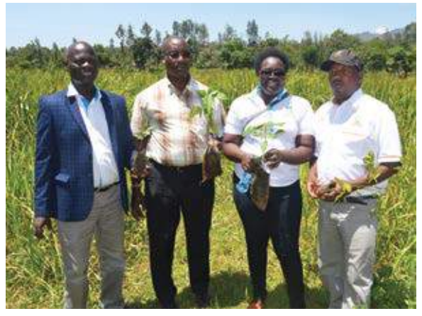
NEMA staff with tree seedlings during the international forest day in Meru County

First observed in 2013, the IDF has become a useful platform to showcase the contributions of forests to global development the contributions of forests as well as the preservation of the world's global cultural heritage and diverse biological resources. The Day offers a unique opportunity to reflect on the state of forests and challenges confronting the world's forests in order to rally actions on how to tackle the threats and advocate for sustainable management of the global forest resources.