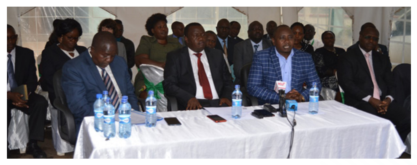
The meeting in progress at NEMA headquarters

(The writer is NEMA's Intern at Communications Section)