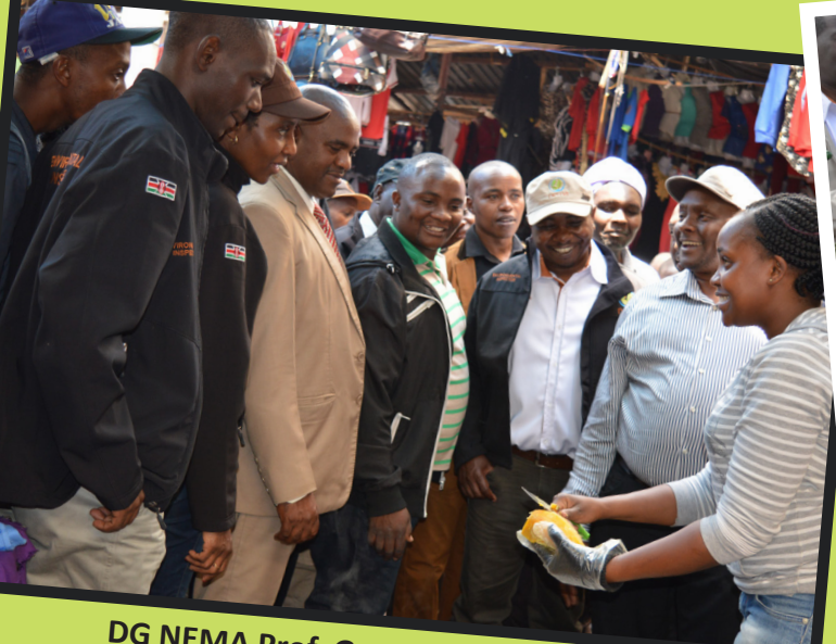
DG NEMA Prof. Geoffrey Wahungu during the inspection of plastic bags at Muthurwa Market, Nairobi