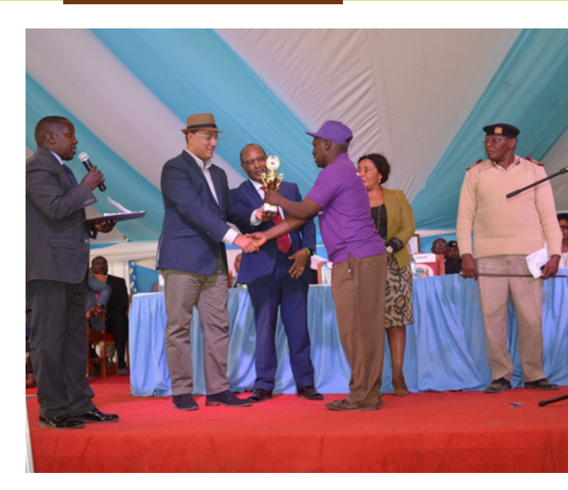
Cabinet Secretary for Tourism, Najib Balala awards one of the winners in the arts competition during the celebrations

The clean took place at Kasuku market on 31<sup>st</sup>