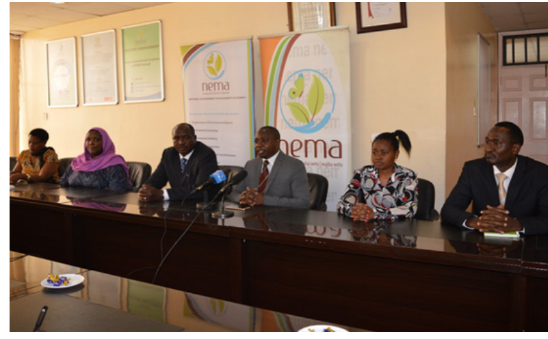
A section of NEMA board members and management during the press briefing at NEMA headquarters