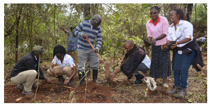
NEMA planting trees at Ngong forest

During the launch, a total of 10,000 trees seedling was planted in Ngong forest. Several government and non-governmental organizations took place including NEMA, Kenya Forest Service, Kenya Forest Research Institute, Kenya Metrological Department, Kenya Water Tower Agency and the Red Cross.