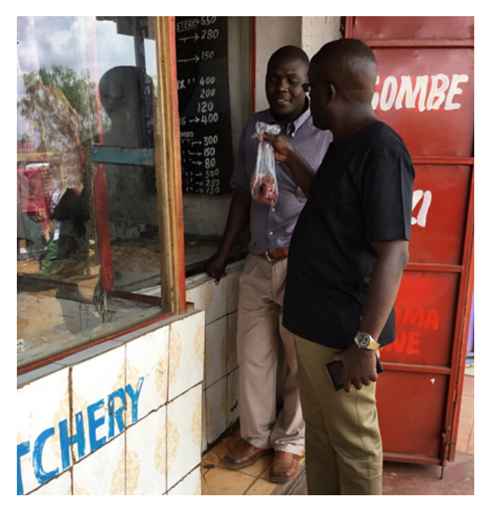
NEMA Deputy Director Compliance inspecting a butchery in Keroka, Kisii county on the banned plastic bags