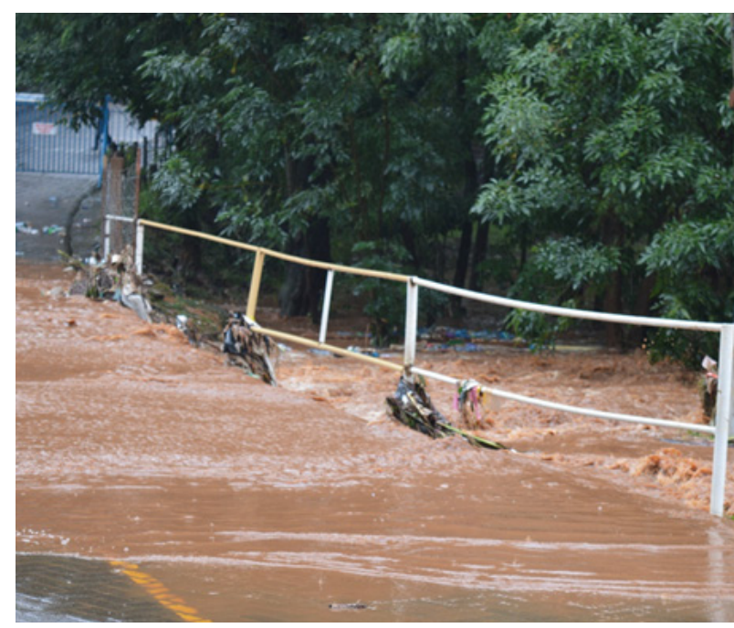
Kirichwa Kubwa River in Nairobi where it was overflowing on the Road

Prof. Wahungu stated that naturally, floods clean up the environment and plastics and debris being witnessed in several parts of the country following