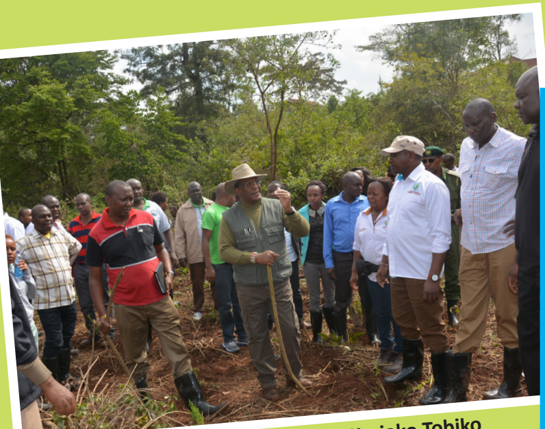
CS Environment and Forestry, Keriako Tobiko inspects tree planting at Ngong Forest