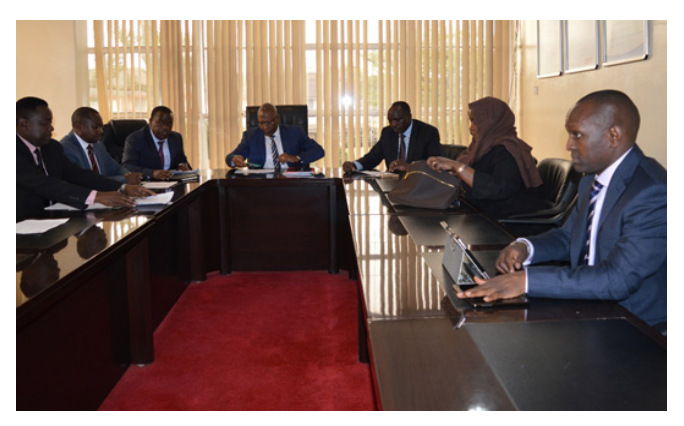
The meeting in progress at NEMA headquarters