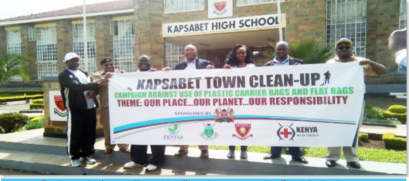
The cleanup planning committee members lift up a banner sponsored by NEMA during the cleanup

The NEMA Nandi County office in conjunction with the Nandi county government held a colorful cleanup exercise at Kapsabet town. The event was flagged off at Kapsabet High School on 14<sup>th</sup> September by the deputy governor Nandi County H.E Dr. Yulita Cheruiyot.