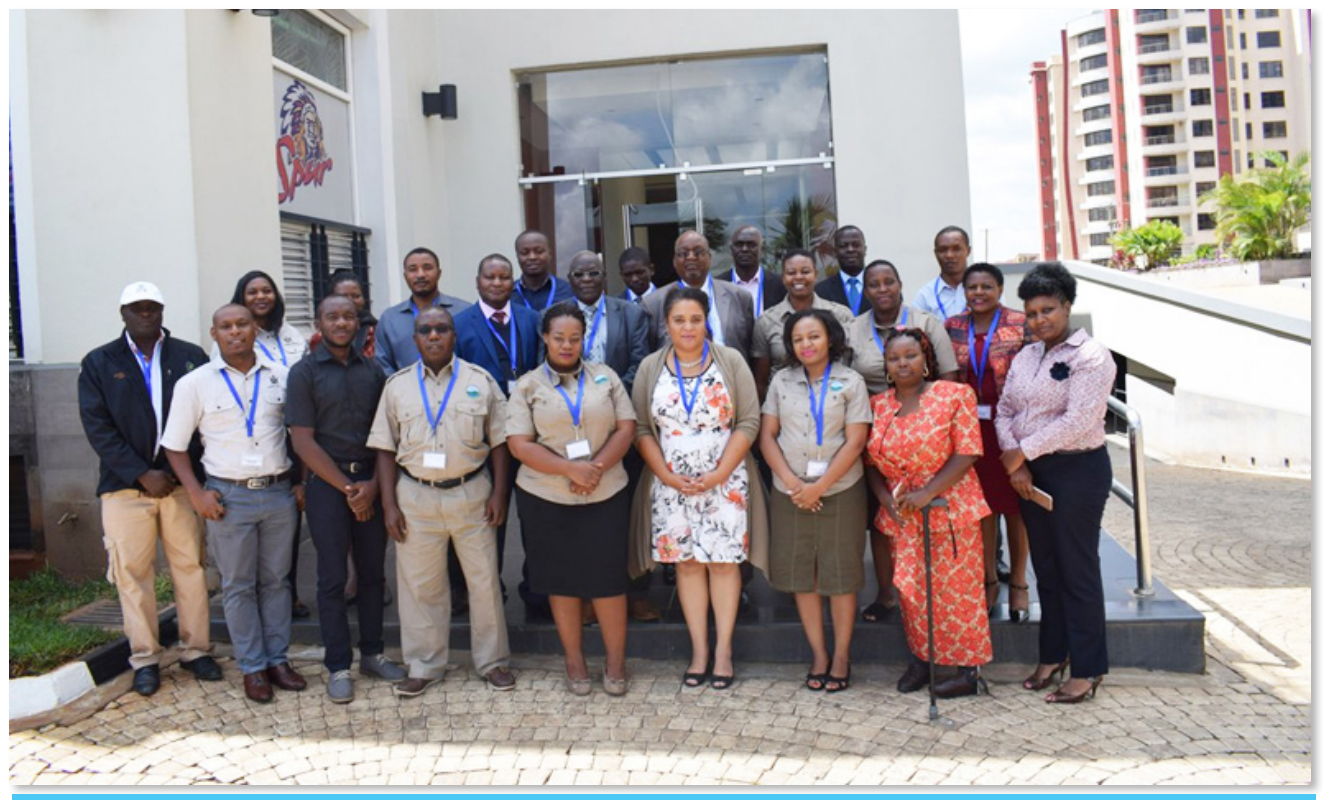
NEMA Staff with South-South NIEs from Malawi and Zimbabwe in a group photo during the training