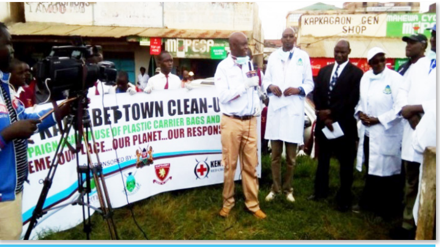
NEMA Nandi CDE Mahiva addressing the public during the event

{The writer is NEMA's CDE in Nandi County}