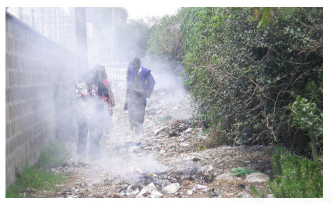
OPEN BURNING

Yes. Most countries in Western world have prohibited open burning of waste in municipalities and in landfills. Where it is unavoidable, there are guidelines for carrying it out.