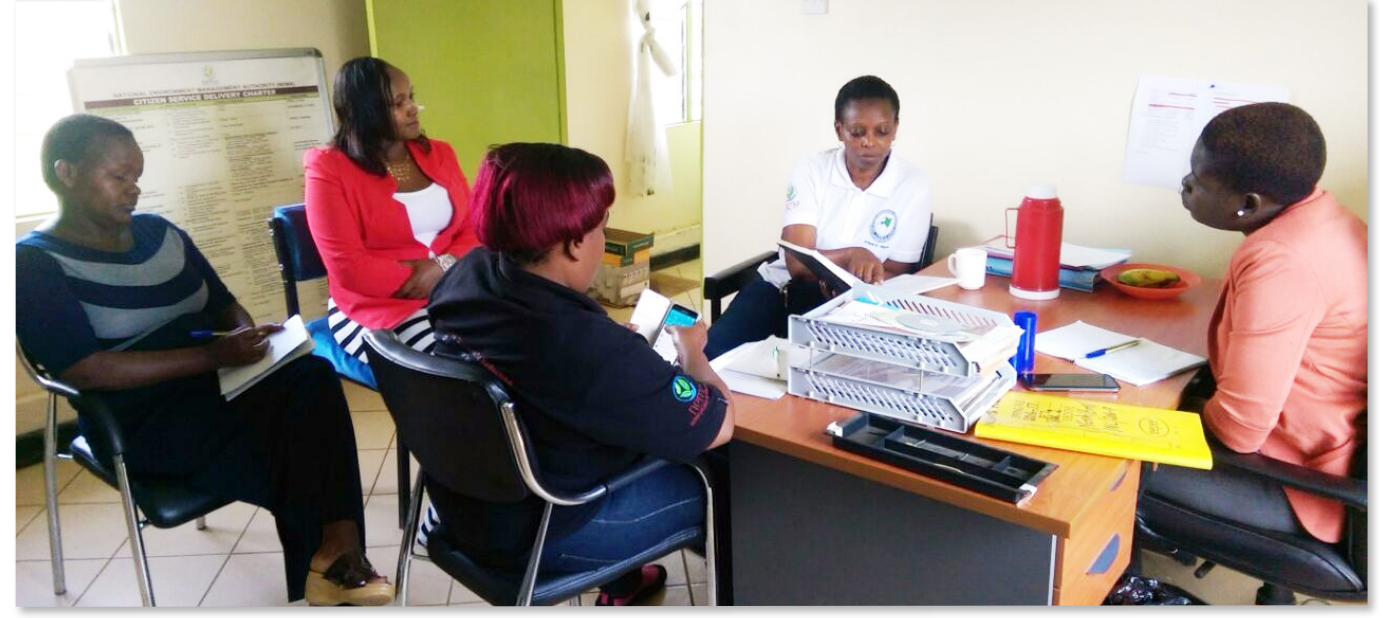
Staff undergoing training on Service Charter and resolution of public complaints

n support of our pledge to provide our customers with highest level of customer service possible, it is good to keep on reminding staff of our services and commitments as stipulated in the service charter. This was done through sensitization of the service charter to four counties namely: Baringo, Bomet, Eldoret and Nandi.