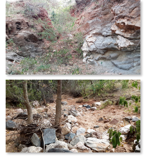
The status of seasonal river near the gemstone belt