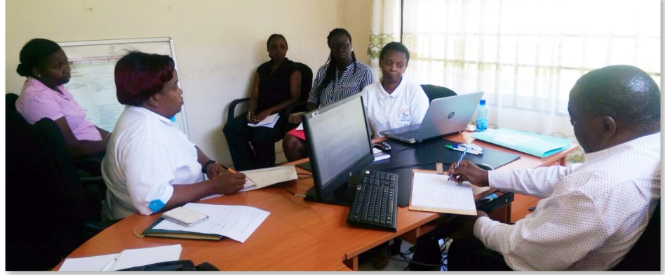
Staff undergoing training on Service Charter and resolution of public complaints

{The writer is NEMA's Corporate Communications Officer}