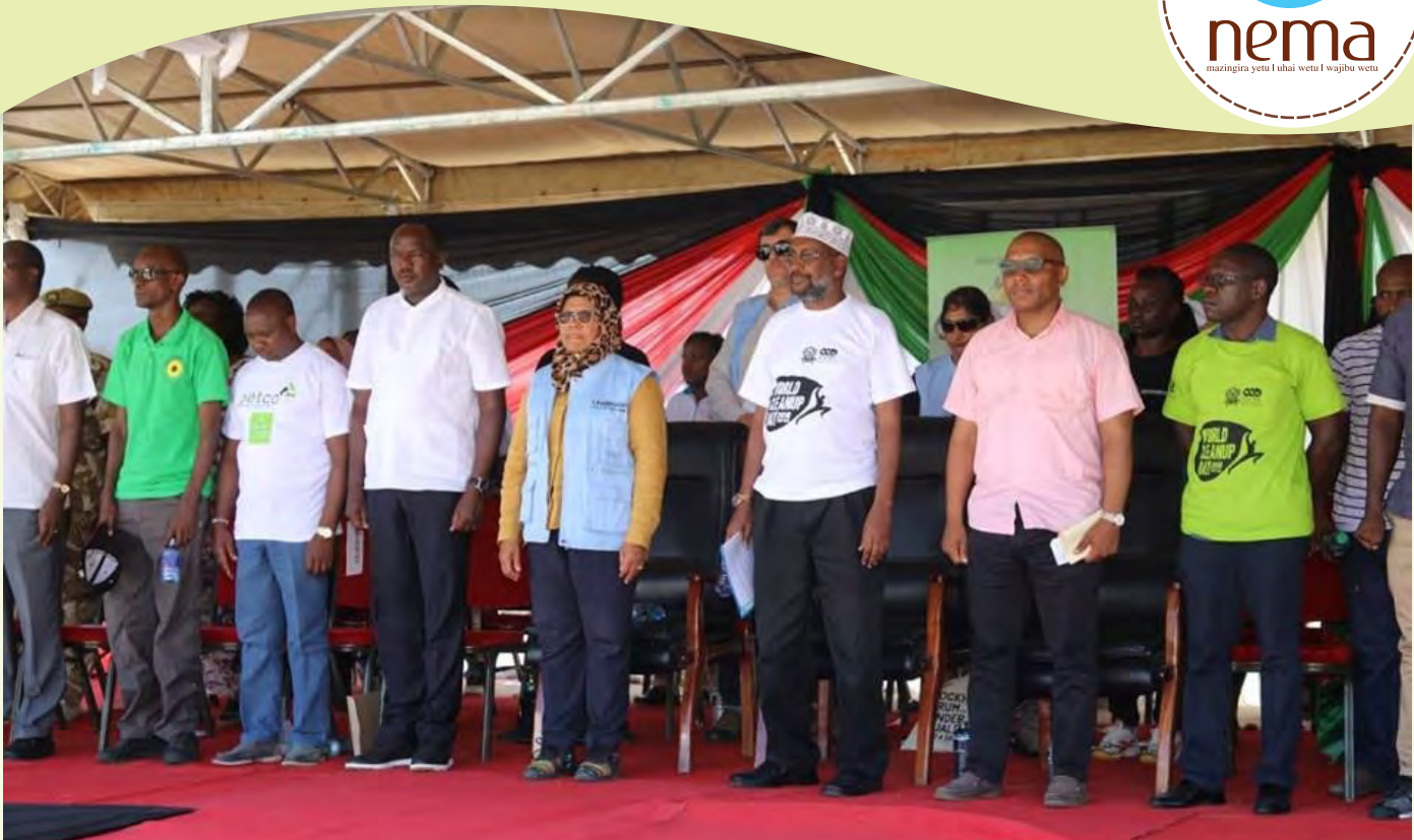
Dignitaries who participated in the cleanup exercise at Mama Ngina Drive, Mombasa