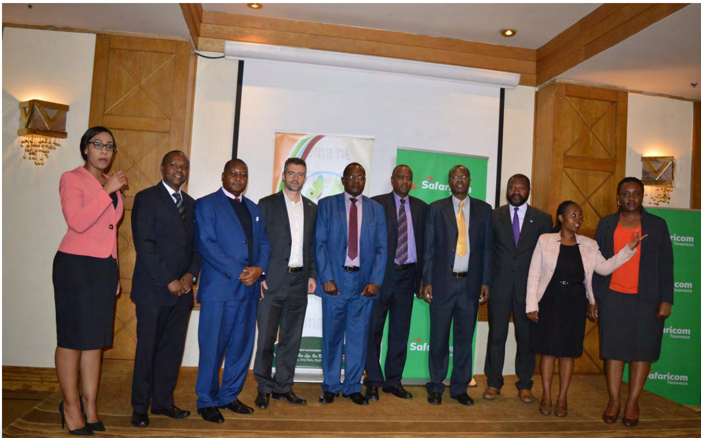
Participants in a group during the forum at Inter-Continental Hotel, Nairobi

[The writer is NEMA's Corporate Communications Officer]