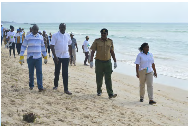
Participants during the cleanup at Jomo Kenyatta Public Beach, Mombasa