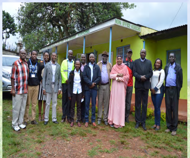
Board members with staff during a visit at NEMA's Kericho County office