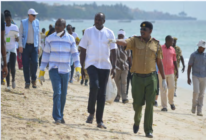
Participants during a cleanup exercise at Jomo Kenyatta Public Beach in Mombasa