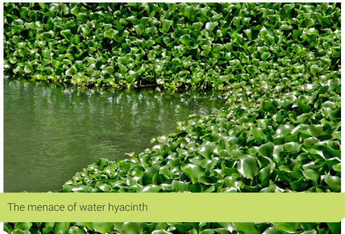
The menace of water hyacinth

{The writer is NEMA's Environment Officer in Kisumu}