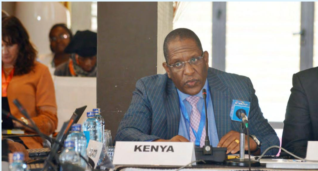
Environment and Forestry CS, Keriako Tobiko addressing the participants during the conference at English Point Hotel Mombasa.