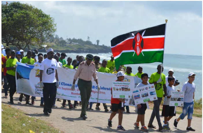
The procession at Mama Ngina Drive in Mombasa during the event