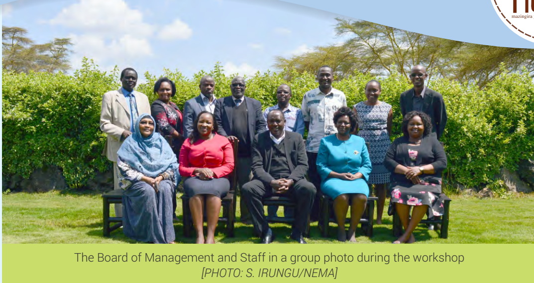
The Board of Management and Staff in a group photo during the workshop