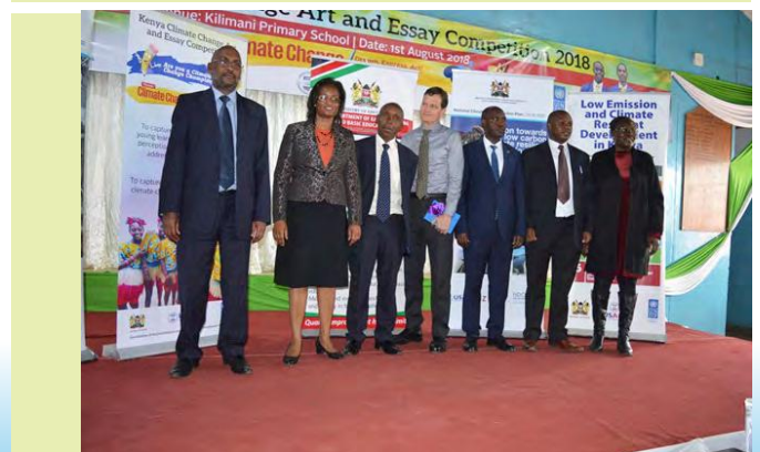
Dignitaries who attended the launch of climate change and art competition at Kilimani Primary School