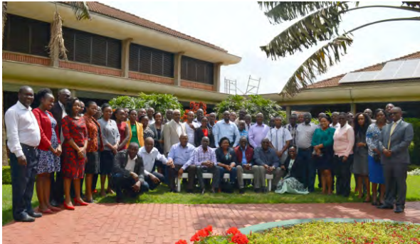
NEMA officials, County officers in a group photo during the event

[The writer is NEMA's Corporate Communications Officer]