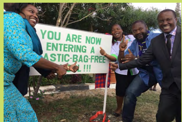
Guests standing at the signage at the school's gate that declares it is a "plastic bag free school" during the event