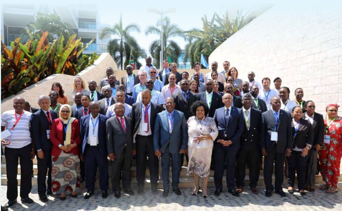
Delegates during the COP 9 conference in Mombasa English Point Hotel

{The writer is NEMA's Corporate Communications Officer}