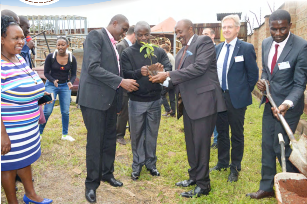
Dignitaries holding a tree seedling during a ceremonial tree planting at Ruaraka during the launch of a circular economy