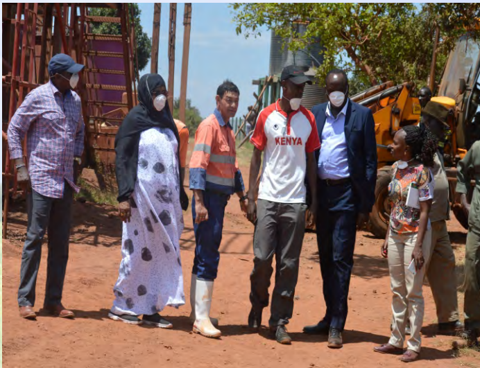
NEMA Board Members, Director General and some staff of Kilima Pesa Gold Mine during the visit to the firm