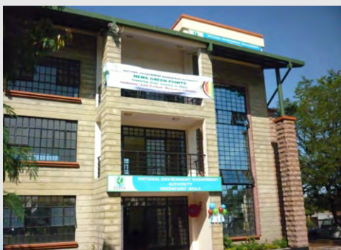
Green Point in Isiolo

A programme management team has been constituted comprising of representation across all departments.