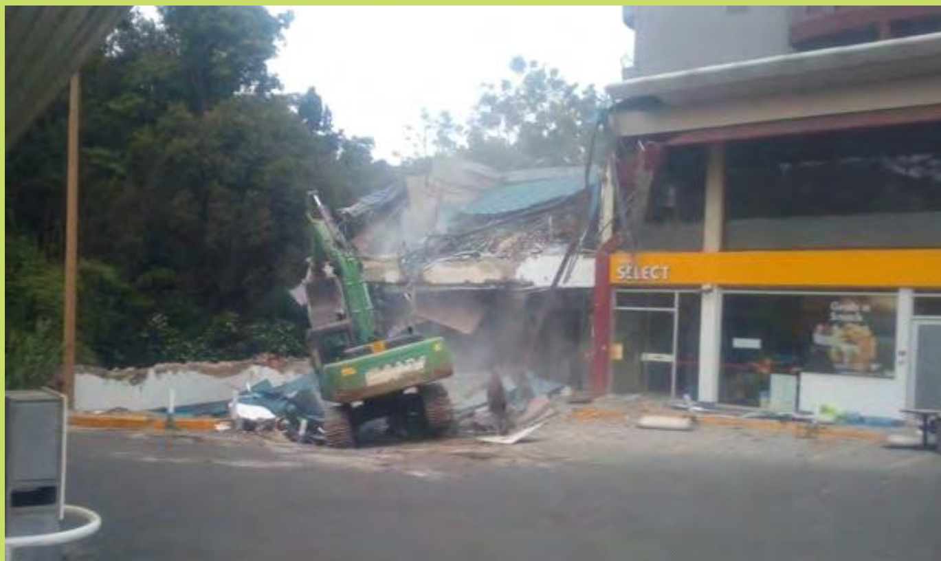
Demolition of Shell Petrol Station in Kileleshwa

{The writer is Brenda Rajwai, NEMA Intern}