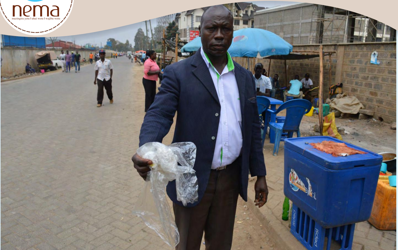
NEMA Officer during an inspection on plastic bags in Nairobi

Most Kenyans have embraced different forms of carrying their goods since the ban took effect. As a result, most of traders sneaking plastic bags to the black market have even found it hard to utilize them. As a result, the Authority has reported high levels of compliance all over the country. This has contributed to the environment being generally clean. After the ban, the Authority established plastic bags drop-off points at the major supermarkets throughout the country to enhance compliance.