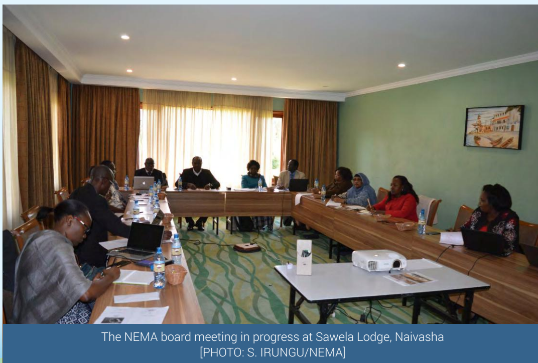
The NEMA board meeting in progress at Sawela Lodge, Naivasha

{The writer is NEMA's Corporate Communications Officer}