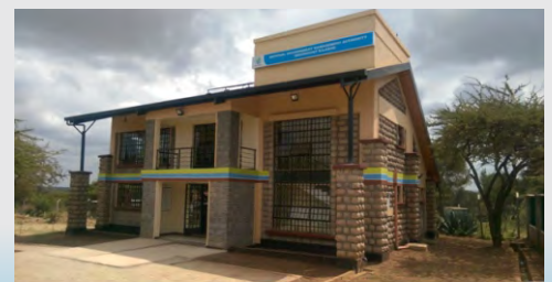
Kajiado Green Point

"While I have travelled to Denmark I have attended one course through DFC and a study tour of the municipality of Odense courtesy of Danish Environmental Protection Agency (DEPA). The first course I attended was on Natural Resources management that had international participants and hence it offered me a great opportunity to share my experience with other professionals in the world, and we continue to interact and network to date. I was privileged to attend a study tour that gave me the chance to learn how Denmark, a developed country manages her environment because it is very clean and beautiful. From that experience I remain hoping to get an opportunity to work with the Danish