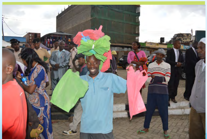
A trader selling some of biodegradable bags in Ngong town.

The purpose of the Government to ban the use of plastic bags is to avoid health and environmental effects resulting from the use of plastic bags.