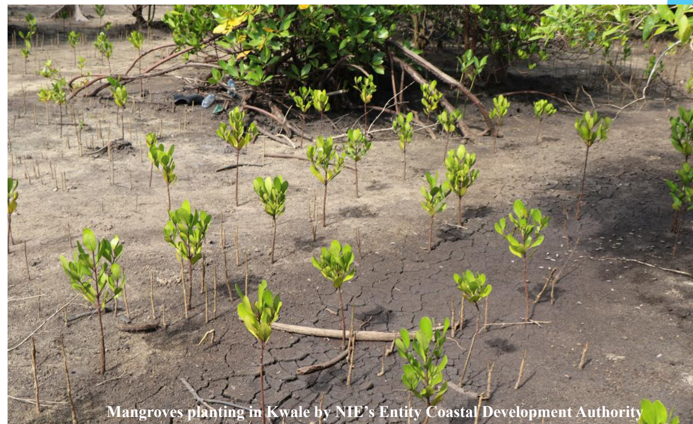
Mangroves planting in Kwale by NIE's Entity Coastal Development Authority

A concrete adaptation project -a set of activities aimed at producing visible and tangible results on the ground by reducing vulnerability to CC and increasing the adaptive capacity of human and natural systems.