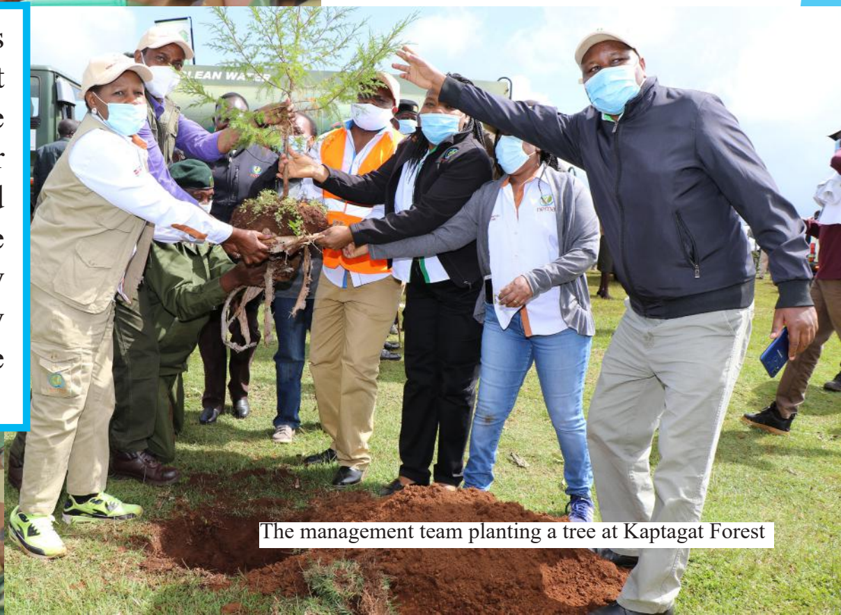
The management team planting a tree at Kaptagat Forest

In contribution towards achievement of 10 percent tree cover by 2022, the Authority has joined other government agencies and private entities through the coordination of the Ministry of Environment and Forestry to plant trees throughout the 47 Counties.