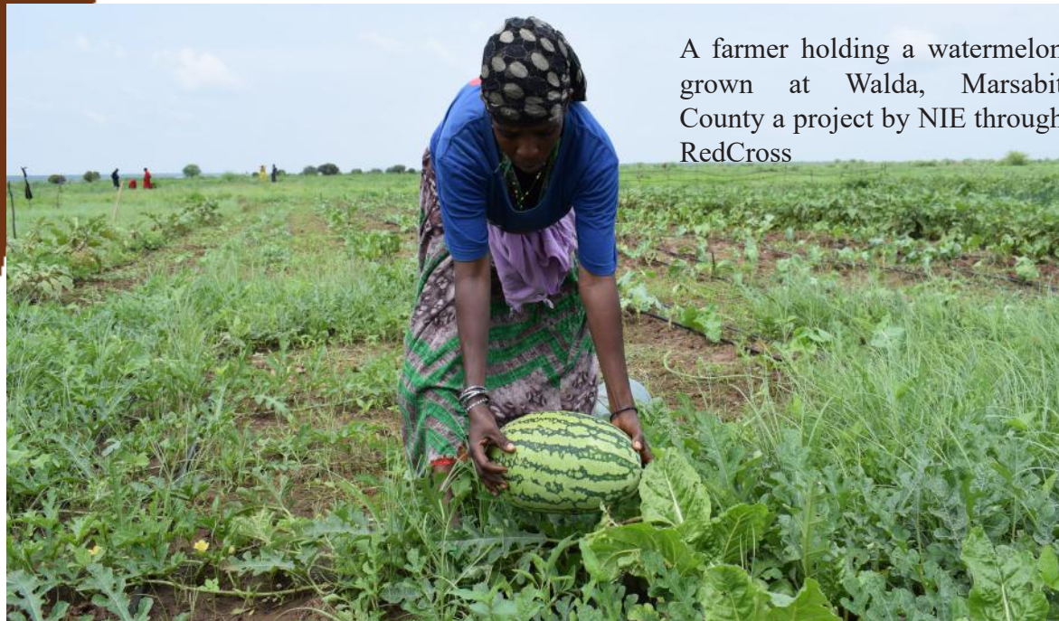
A farmer holding a watermelon grown at Walda, Marsabit County a project by NIE through RedCross

National Environment Management Authority (NEMA) is the National Implementing Entity (NIE) for Adaptation Fund in Kenya. NEMA was nominated by the Ministry of Environment, Water and Natural Resources to be the NIE under the Adaptation Fund (AF). In March 2012, NEMA obtained its accreditation by the Adaptation Fund Board of UNFCCC. This accreditation gave NEMA the mandate to offer vetting, approval and supervision of projects financed by the Adaptation Fund. The NIE bears full responsibility for the overall management of programmes and project in terms of financial, monitoring and reporting to the Adaptation Fund.