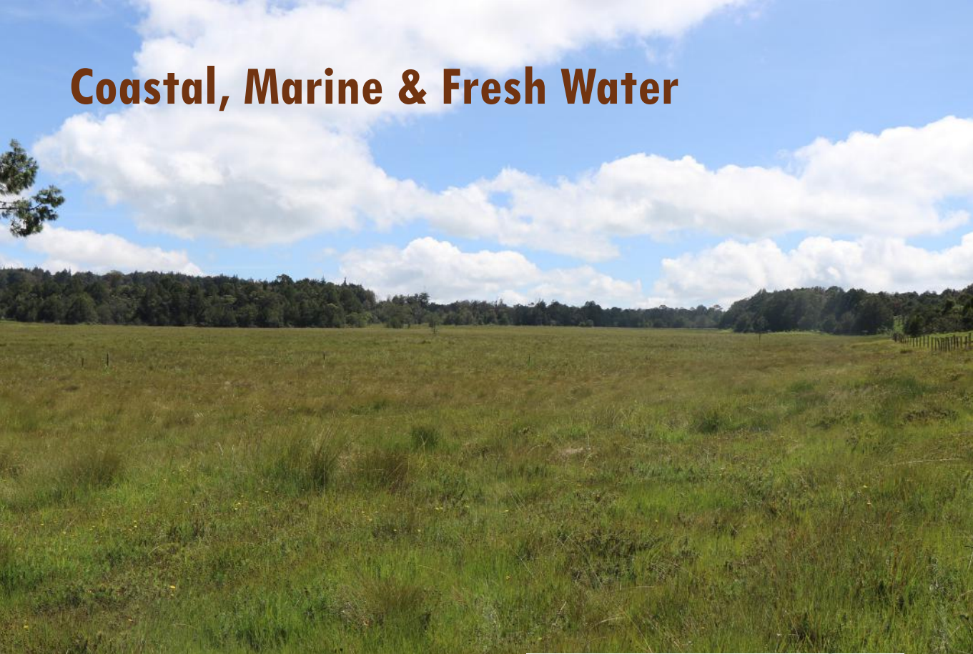
Enapuiyapui Wetland in Nakuru County

This is a sub-department under the Directorate Department and draws its mandate from Sections 42 & 55 of EMCA that deal specifically with management and conservation of rivers, lakes and wetlands; and coastal and marine environments respectively to address issues of fresh water, coastal and marine ecosystems.