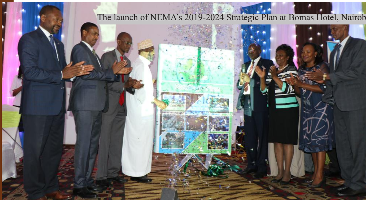
The launch of NEMA's 2019-2024 Strategic Plan at Bomas Hotel, Nairobi