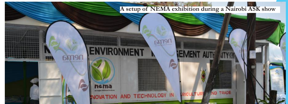
A setup of NEMA exhibition during a Nairobi ASK show