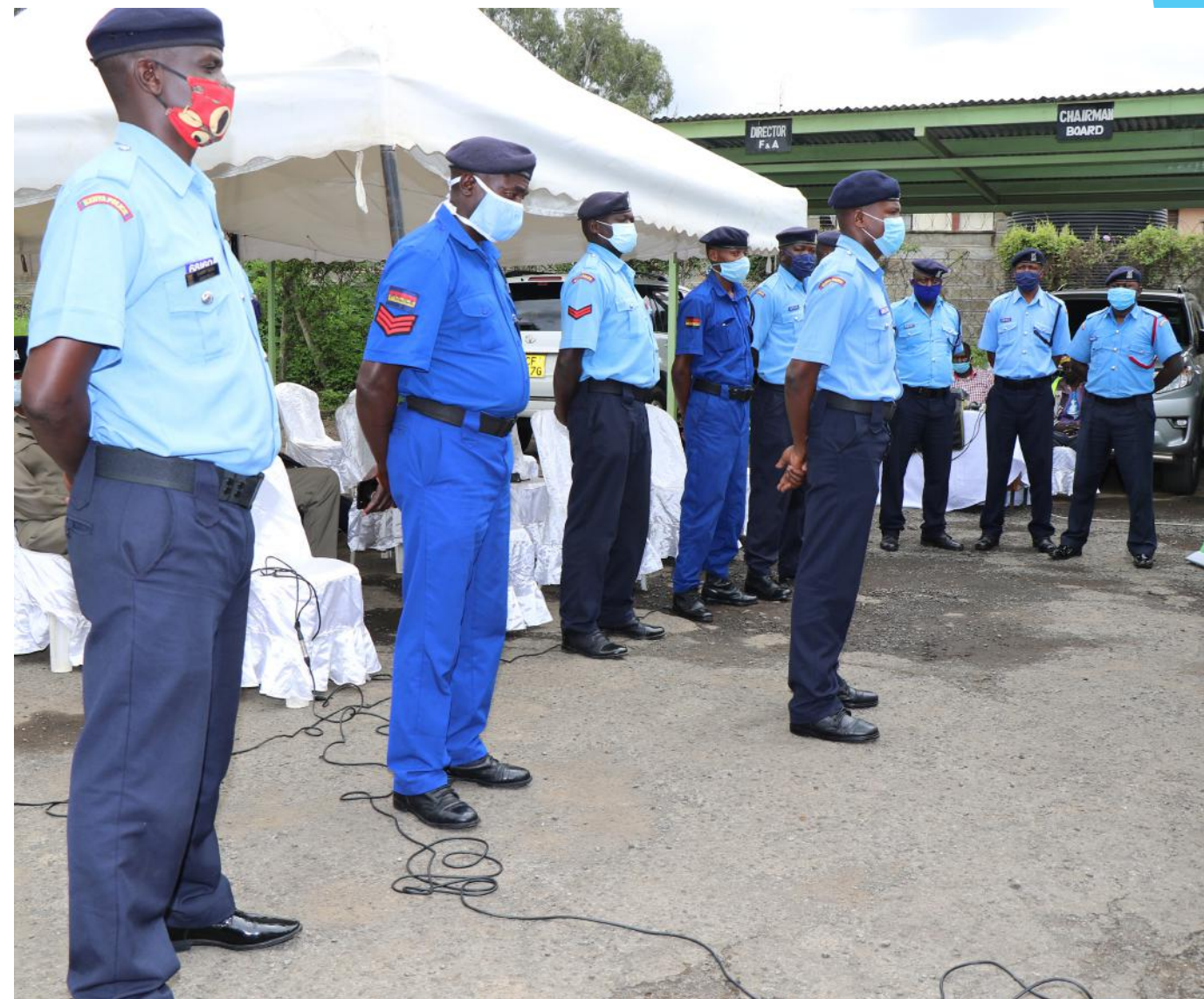
Police officers deployed to NEMA in May 2020

The officers also conduct regular surveillance to detect environmental crimes as well as apprehending and prosecuting environmental offenders. In this regard, the NEMA police Unit has strengthened prosecutions of environmental cases across the country while serving as deterrent to potential environmental offenders.