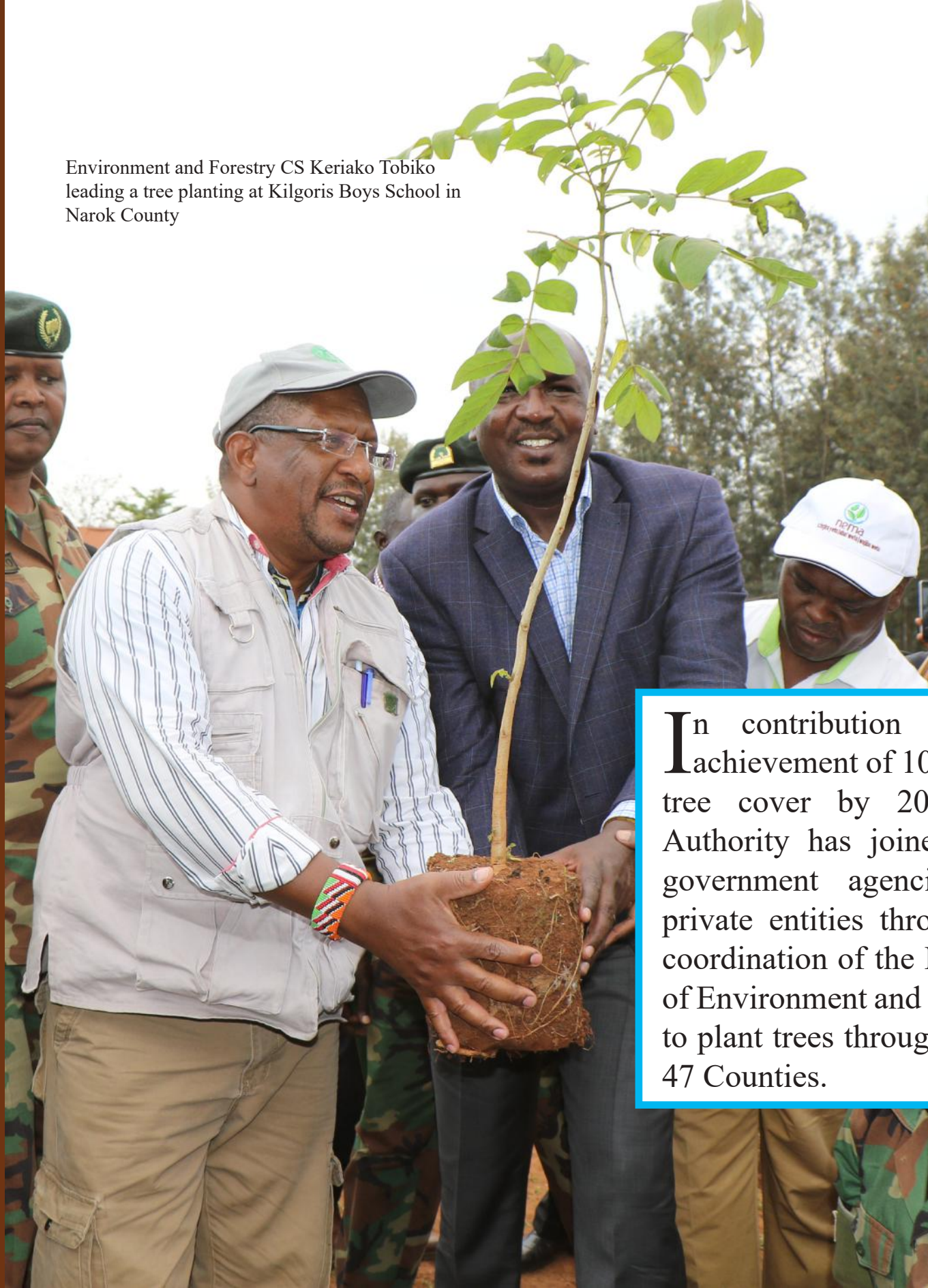
Environment and Forestry CS Keriako Tobiko leading a tree planting at Kilgoris Boys School in Narok County