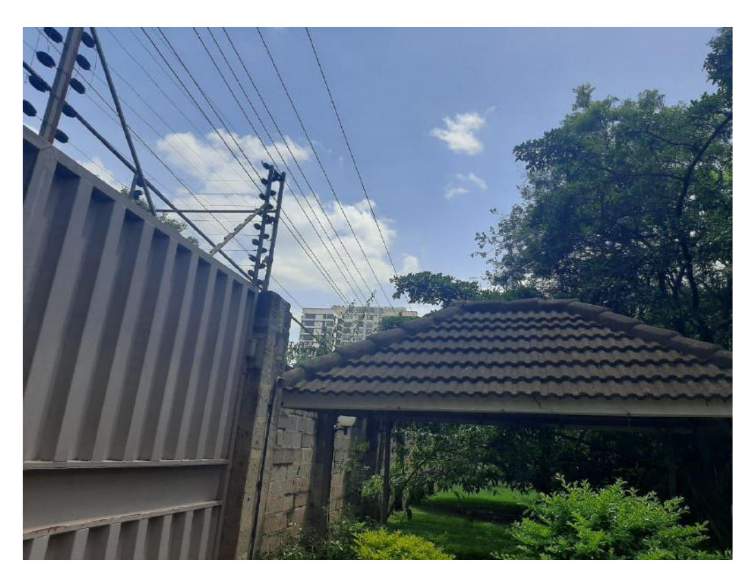
Figure 2: Neighbouring similar development