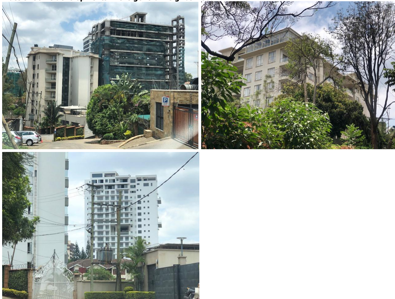
Plate 3: Some developments in the general neighborhood

Similar high-rise developments have been implemented in the general neighborhoods while others are ongoing.