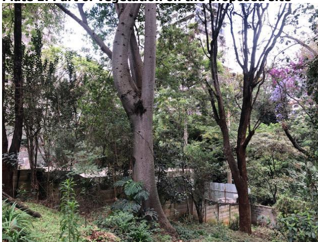
Plate 1: Part of vegetation on the proposed site

There is no fauna/wildlife threatened by the development except may be rodents and insects.