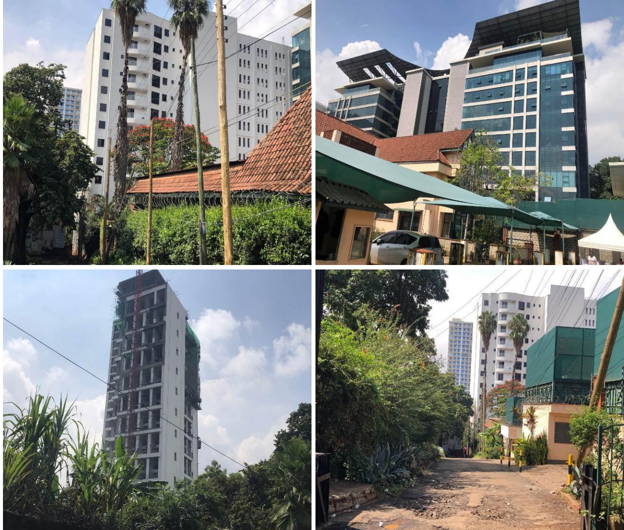
Plate 4: Some general developments in the neighborhood

Similar high-rise developments have been implemented in the general neighborhoods while others are ongoing.