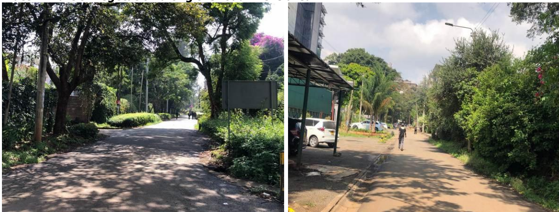
Plate 1: Part of vegetation along the road in the area

There is no fauna/wildlife threatened by the development except may be rodents and insects.