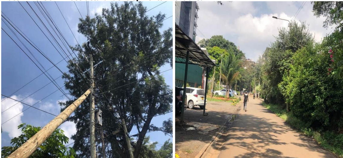
Plate 2: Part of infrastructural developments in the area

The immediate access road is Riverside Lane off Riverside Drive that is well connected to other roads.