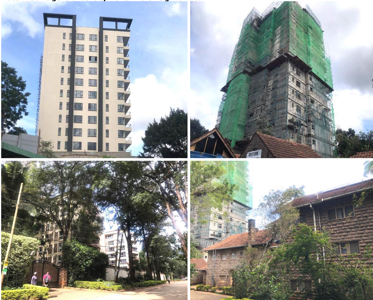
Plate 4: Some general developments in the neighborhood

Similar high-rise developments have been implemented in the general neighborhoods while others are ongoing.