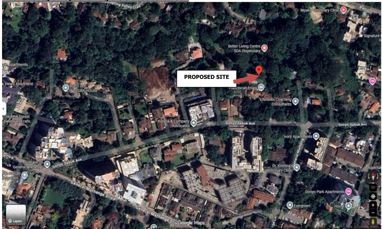
Plate 3: Google maps showing the exact site location

The proposed project site is Land Reference Number NAIROBI/BLOCK 6/743 (0.4065Ha) along Donyo Sabuk Avenue off General Mathenge Drive in Westlands, Nairobi County.