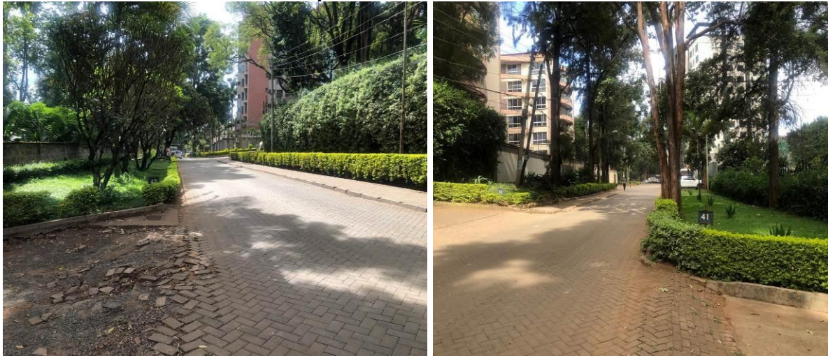
Plate 2: Part of infrastructural development in the area

The immediate access road is Donyo Sabuk Avenue that is well connected to other roads.