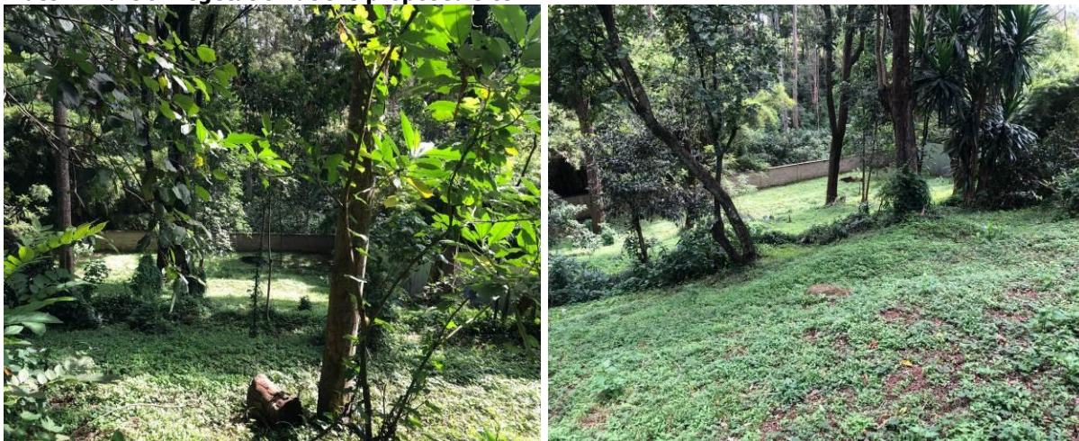
Plate 1: Part of vegetation at the proposed site

There is no fauna/wildlife threatened by the development except may be rodents and insects.