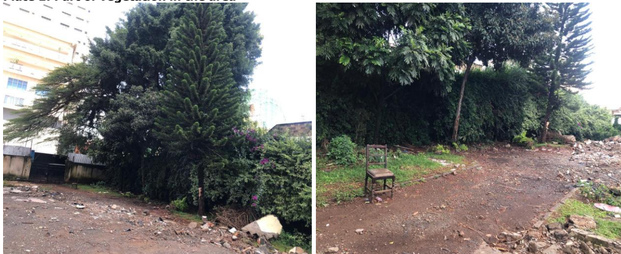
Plate 1: Part of vegetation in the area

There is no fauna/wildlife threatened by the development except may be rodents and insects.