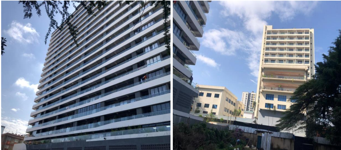
Plate 4: Some general developments in the neighborhood