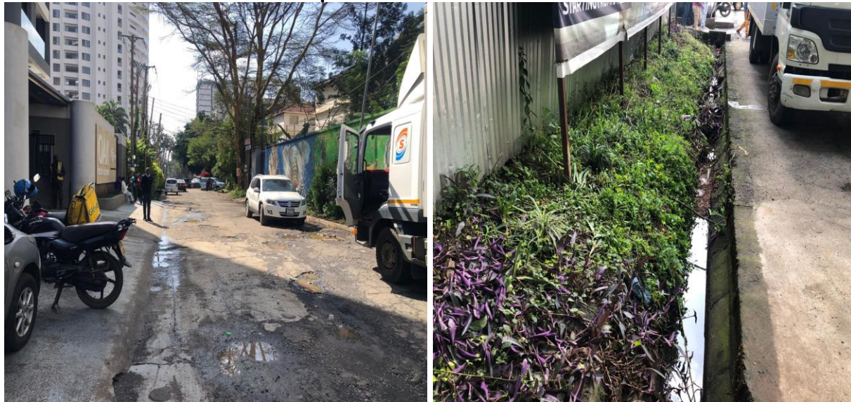
Plate 2: Part of infrastructural developments in the area

The immediate access road is George Padmore that is well connected to other roads.